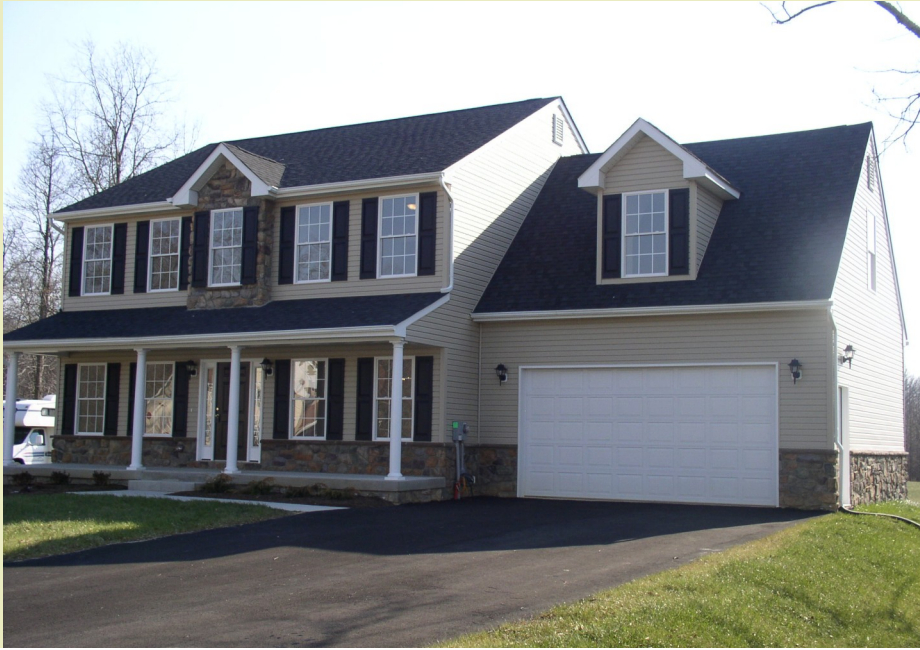
The Brandywine Model

The Brandywine Model is a colonial styled home with a formal dining room, living room as well as a great room. There are many options available including hardwood floors, custom kitchen choices, a second floor laundry, gas fireplace, a finished basement and many more. The base model is a 4 bedroom home with 2.5 baths. The front elevation can be done in Stone, Brick, Siding or a combination of all three. We welcome your custom revisions! Please inquire with one of our sales staff for more information and options. (The Brandywine Model requires a wider lot than normal due to the width of the home)